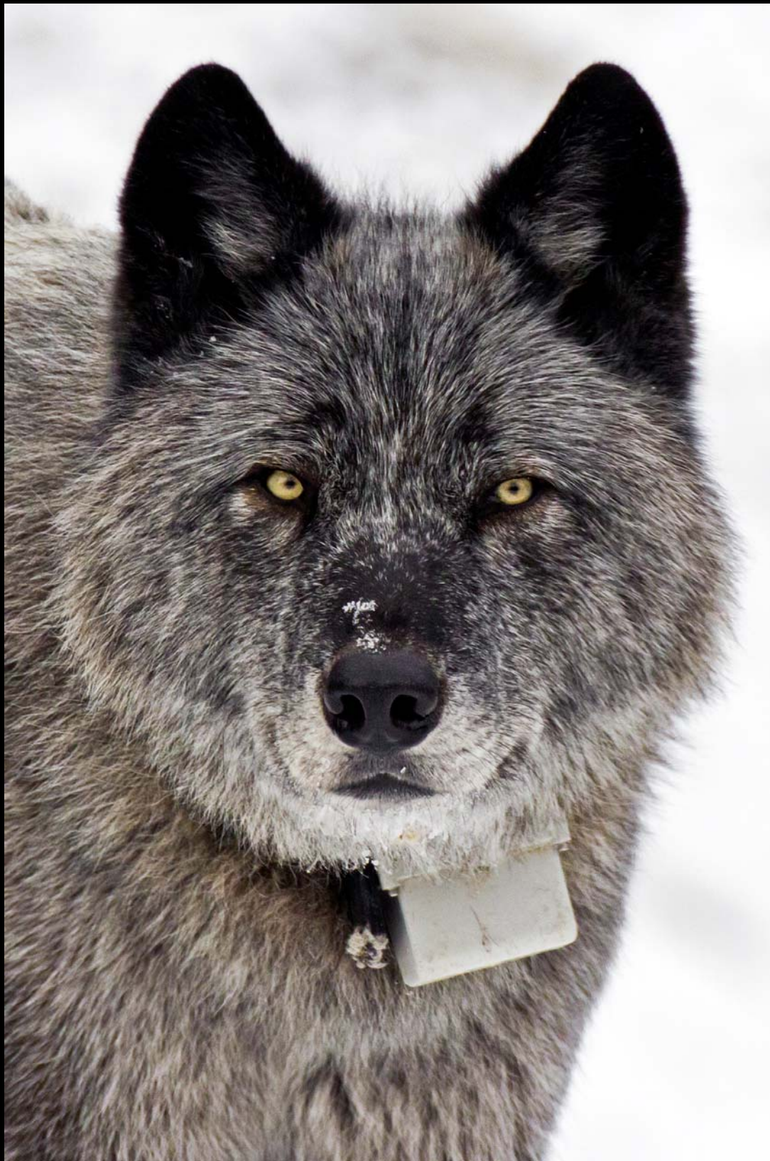
Female Wolf No. 1101 'Blizzard'